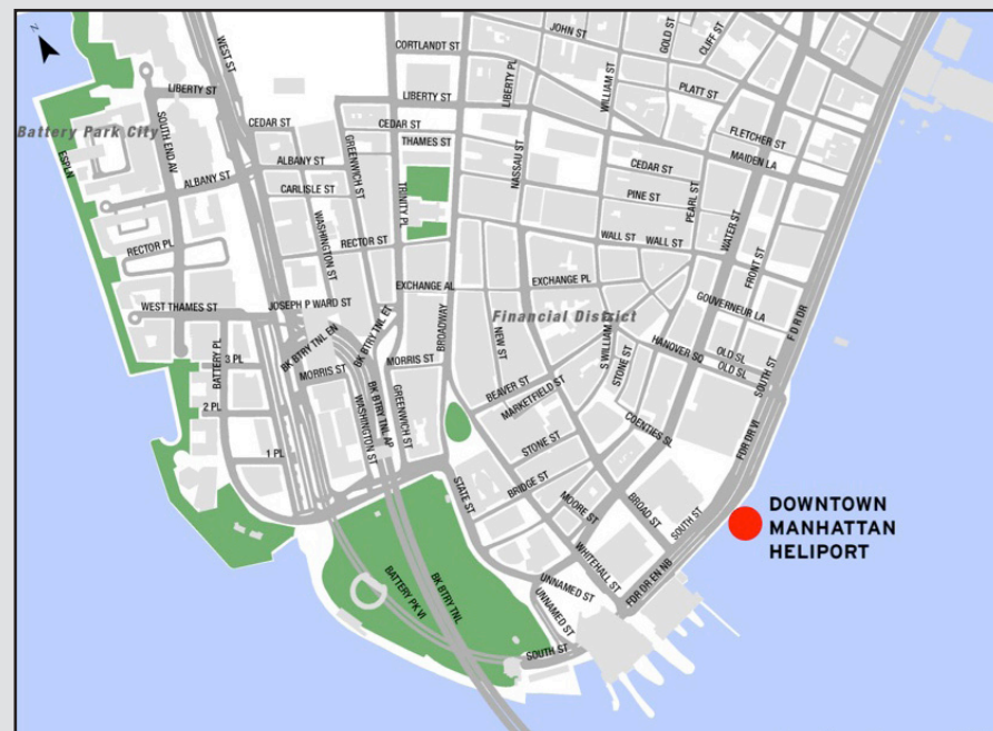
Figure 4: Map of the Downtown Manhattan Heliport and surrounding area

The facility is open between 7:00AM to 10:00PM on weekdays, from 9:00AM to 7:00PM on Saturdays and from 9:00AM to 5:00PM on Sundays. Air tours can only operate between 9:00AM and 7:00PM on weekdays.