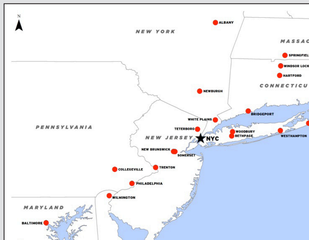
Figure 6: Map of the most common origin and destination points for corporate helicopter flights into and out of New York City.

Most of the reasons companies use helicopter transportation revolve around a single purpose — reducing the time that high-level executives and other key personnel spend traveling between New York City and other locations in the tri-state area and beyond. Applesseed asked how companies value helicopter access as a factor in doing business in the City. Of those that responded, 80 percent rated helicopter access as either “very important” or “important” and indicated that without it their presence in New York City would be significantly reduced or even eliminated. Only 20 percent said that loss of helicopter access would not significantly affect their presence in the City.