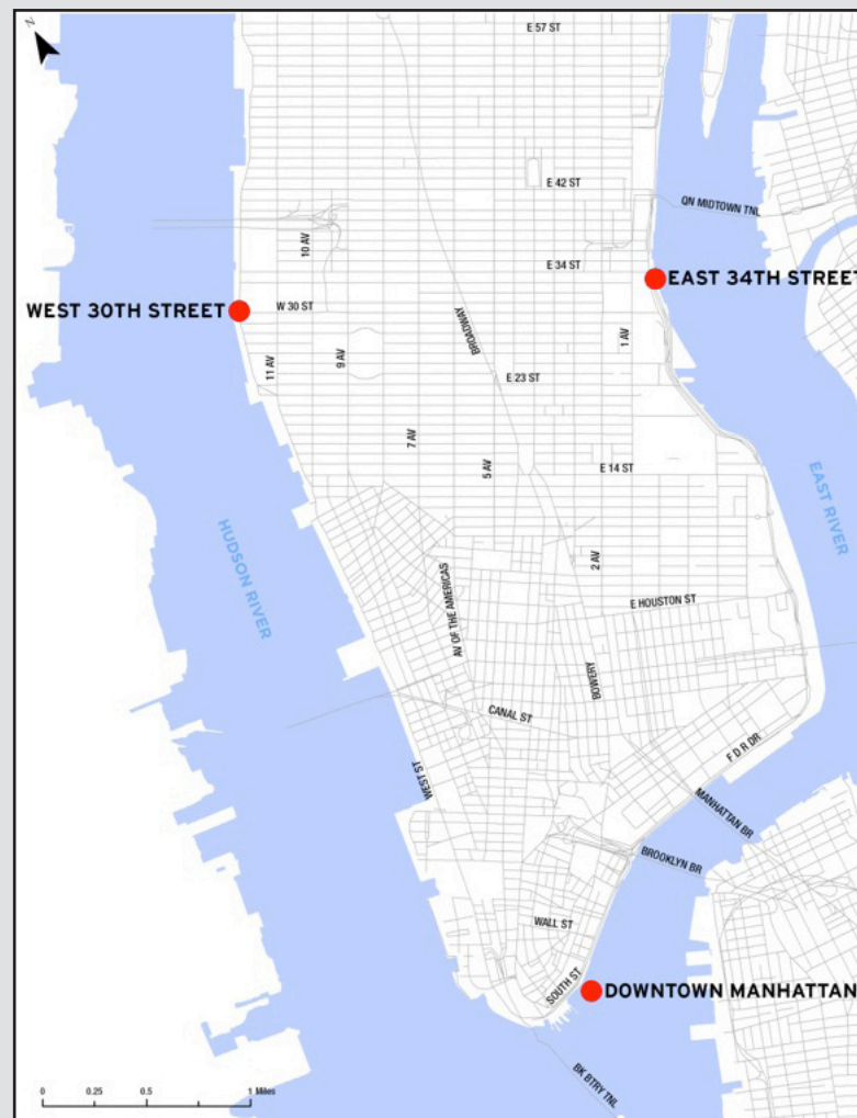
Figure 1: Map of the heliports in Manhattan

The two midtown heliports serve a variety of uses, including corporate transportation, charter services, newsgathering flights, photography and videography, as well as various government, law enforcement and emergency medical purposes. The Downtown Manhattan Heliport serves all of these uses, as well as sightseeing and tourism flights.