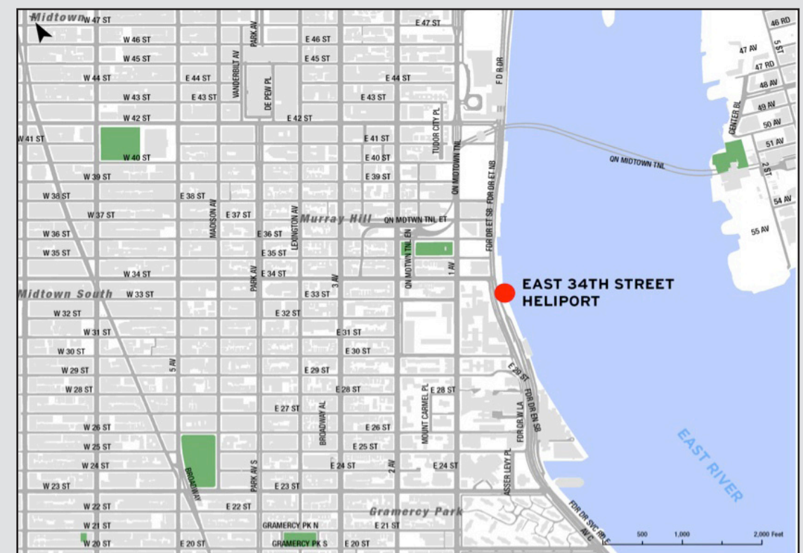
Figure 3: Map of the East 34th Street Heliport and surrounding area

In 2010, East 34th Street handled 7,000 helicopter flights, carrying 14,485 passengers. About 60 percent of these flights were by corporate users, and 20 percent were by charter operators. The remaining 20 percent of flights were a mix of other uses, such as medical flights, law enforcement and aerial photography.