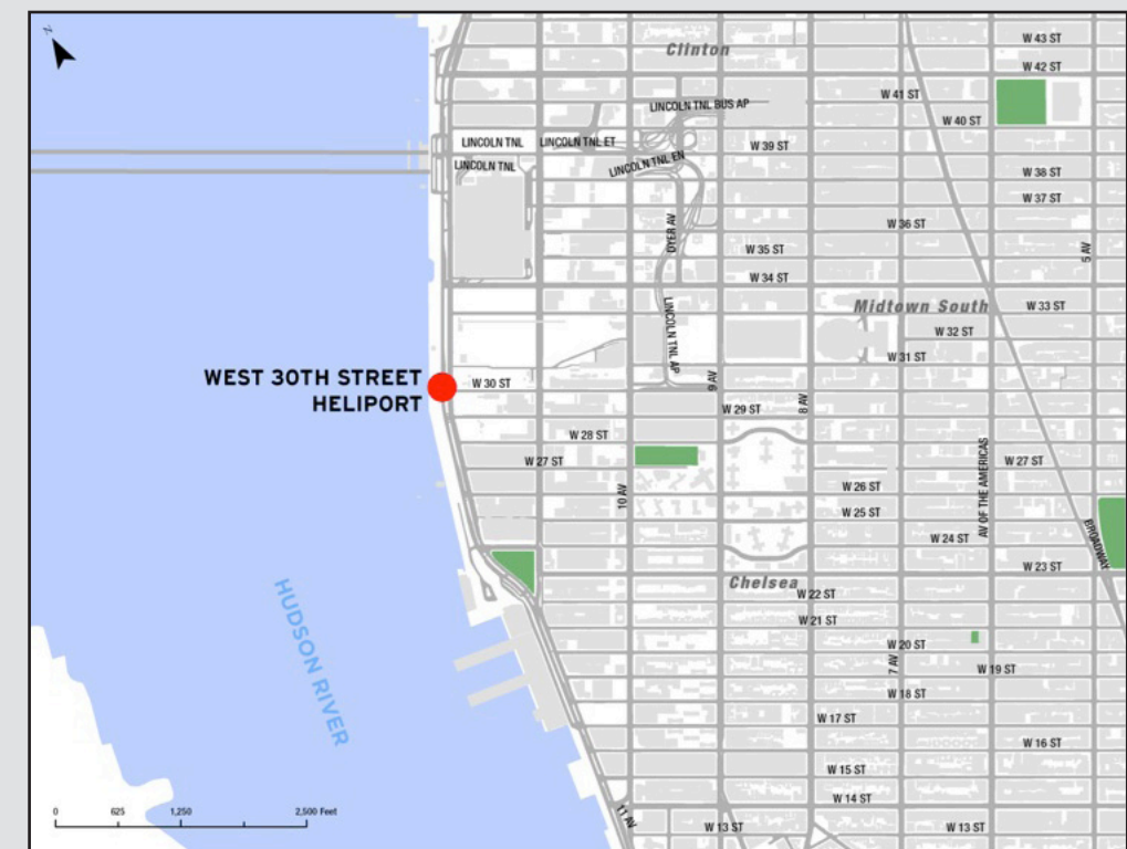
Figure 2: Map of the West 30th Street Heliport and surrounding area

Five percent of all operations at West 30th Street in 2010 were sightseeing flights. However, it is important to note that use of the heliport for tourism purposes ended on April 1, 2010.